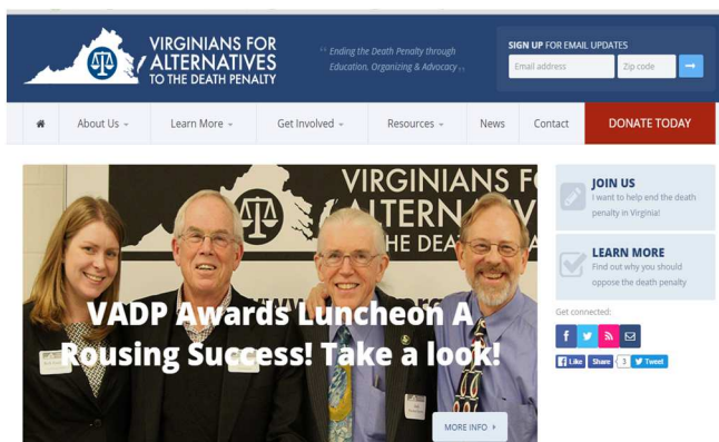
The VADP web site that debuted in November 2015 scales its appearance for mobile devices.