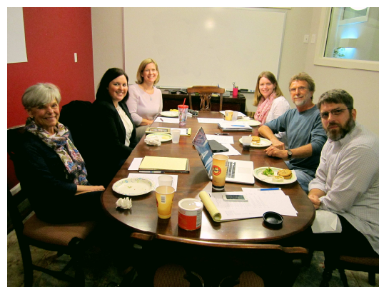
VADP board members at a March 2015 meeting in Charlottesville.