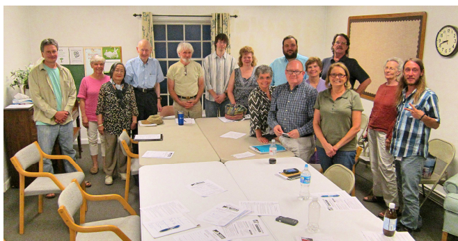
VADP supporters gather in Roanoke in April.